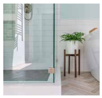
Another Perspective of the Spa Oasis in Bridle Trails