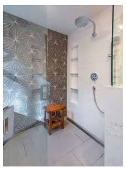
A Liquid Meditation Station