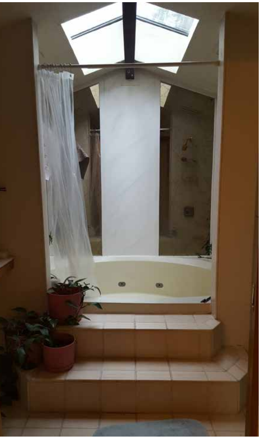
The Unmasterful Master Bath (Before)

The un-masterful bath should be a Masterful Bath, fit for a Queen and a King.