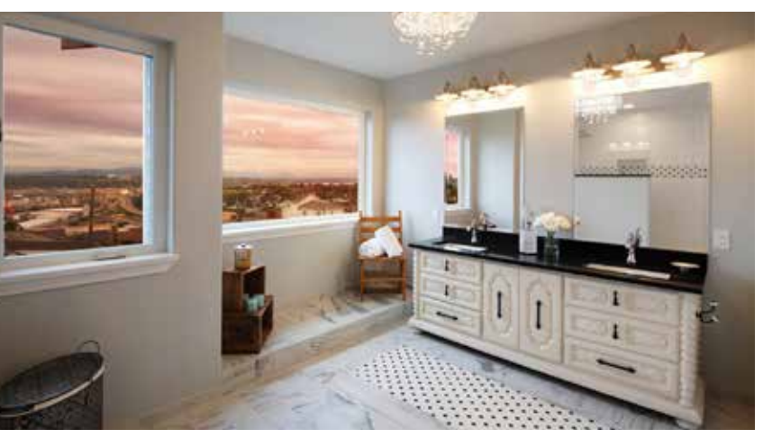
Elbow Rubbing Quarters