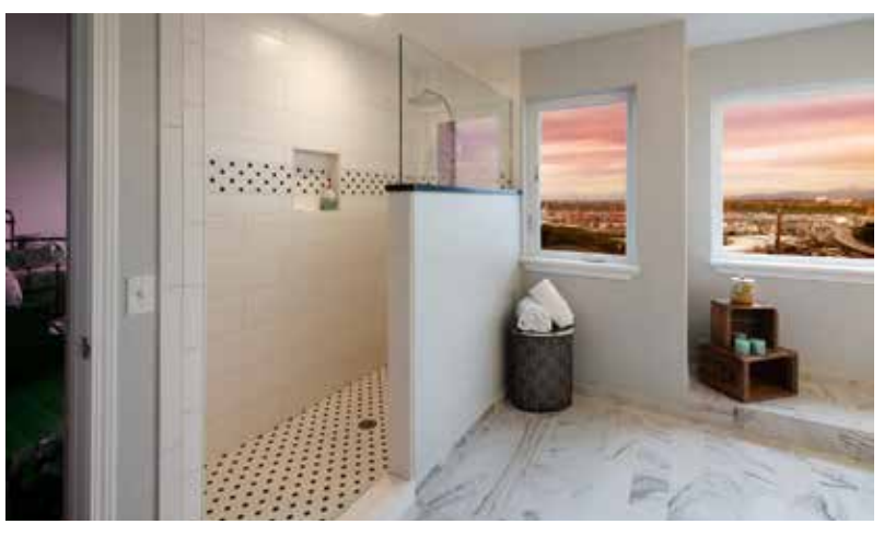
An Urban Oasis with an Amazing Seattle Skyline