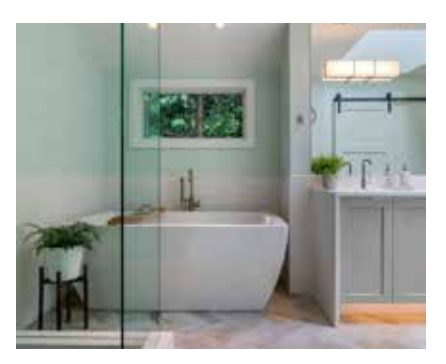
A Spa Oasis in Bridle Trails